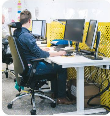
8hr office single user