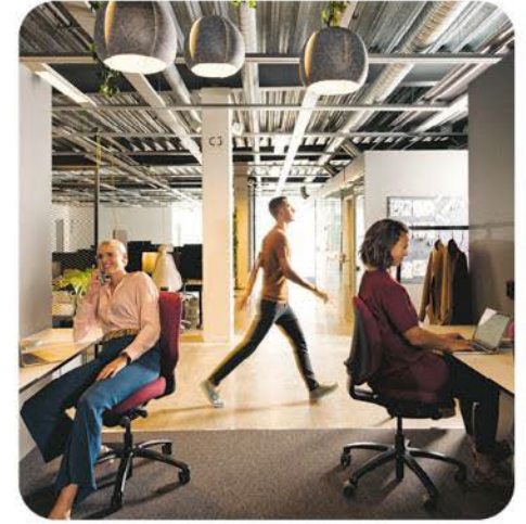
Touch down multi- user (hotdesking)