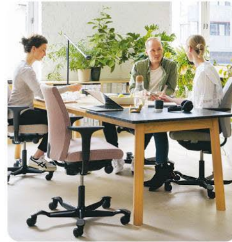
Meeting room (collaboration)