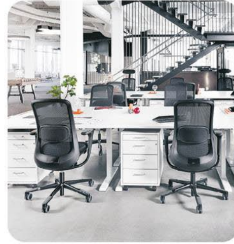
8hr office multi- user (hotdesking)