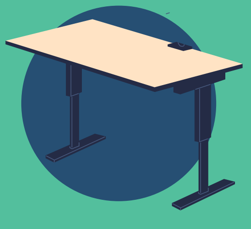
A heightadjustable desk