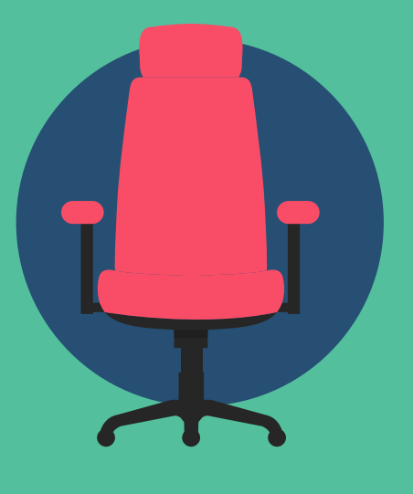
An ergonomic chair